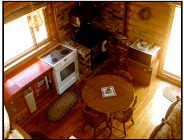
Kitchen & Breakfast Nook