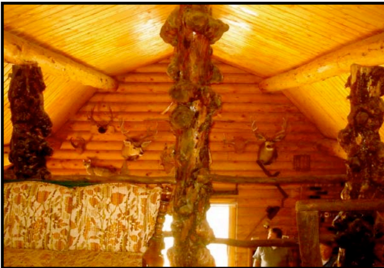
Loft has Burl'd Railings & Supports