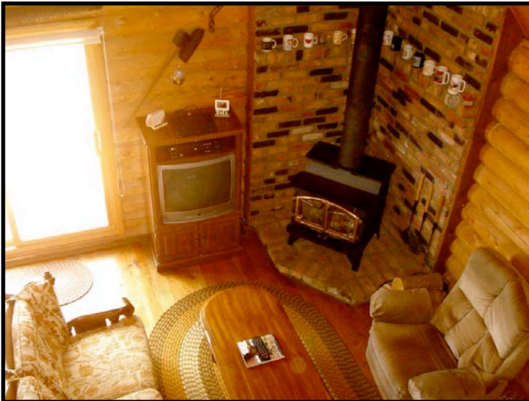
Living Area has Cozy Woodstove