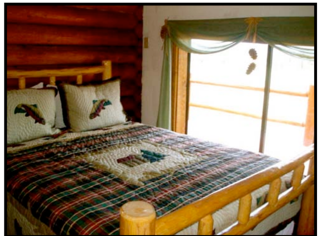
Both Bedrooms Look Over Spectacular Mtn. Scenery!