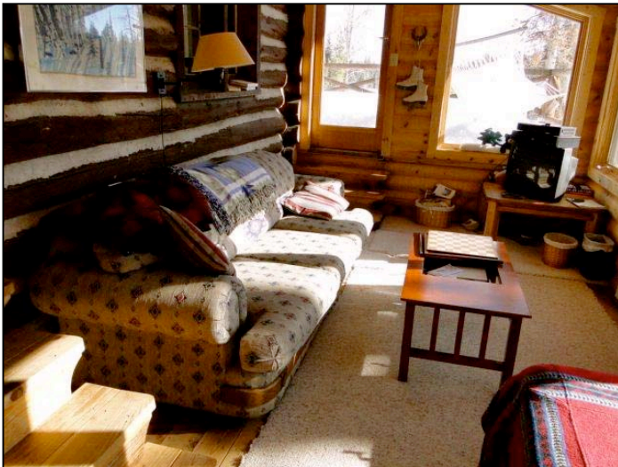
Sunroom Looks out over Brooks Lake Creek!