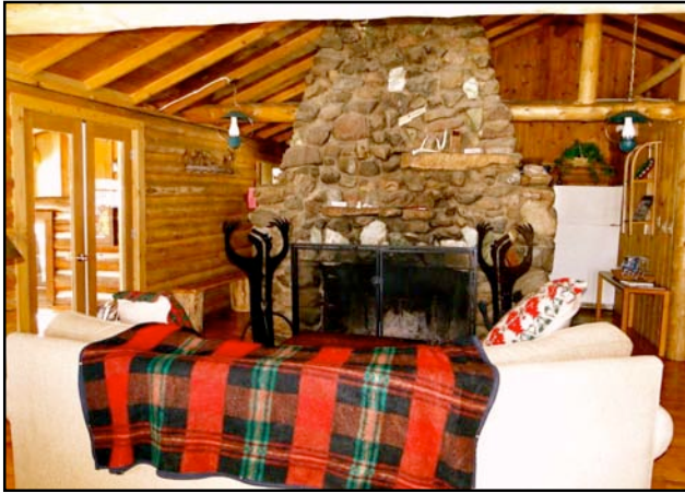
Cozy Living Area with Wood-Burning Rock Fireplace