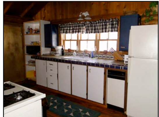
Kitchen has tile countertops & Historic Woodburning Cooking Stove (as well as modern appliances)

Cabin Located only 35 miles to the entrances of Grand Teton & Yellowstone National Parks! 25 miles to quaint cowboy town of Dubois, WY OFFERED AT $249,900.00