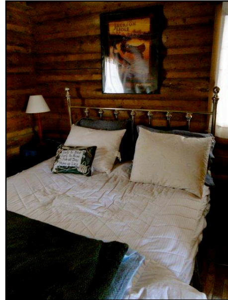
2 Bedrooms with Nice Western Furnishings