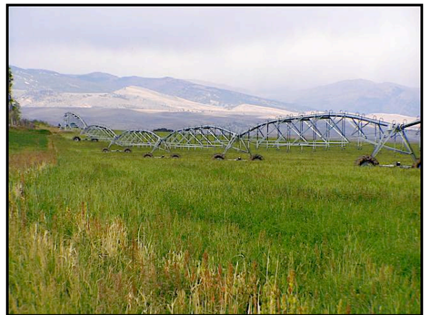
New Pivot System

The nearest airports are: Dubois airport - for those with private or chartered planes - 30 miles; and for those needing commercial air travel, Riverton airport -- 40 miles & Jackson Hole Airport -- 100 miles.