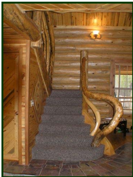
Beautiful Stairs to 2 nd Level