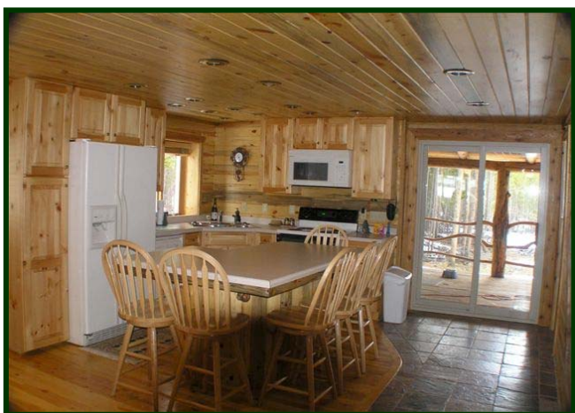
Kitchen & Dining Area Have Lots of Light