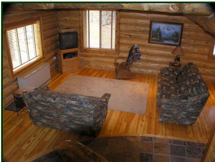
Open Living Area – Pine & Tile Floors Throughout 1 st Level