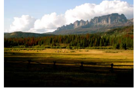
The Pinnacles Views from Log Home

Future owners of this picturesque ranch will benefit from what past owners have affectionally contributed and will undoubtedly add their distinctive impressions as well.