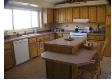
Huge Kitchen w/Island