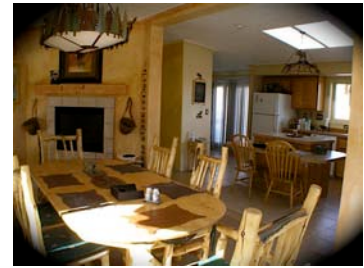
Spacious Dining Room with Lots of Light & Charming Fireplace