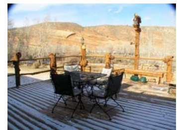
Great Deck for Entertaining!