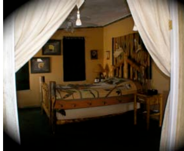
Photos of Master Bedroom