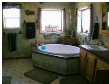
Master Bath has Jetted Tub