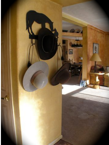
The Home's Entry